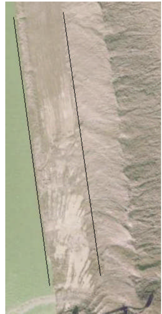
Cutline and Base of Pile