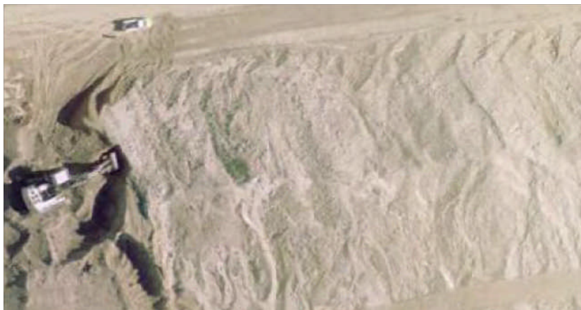
The Pile before using the Dragline Monitor

With or without production lines... Which is more efficient?